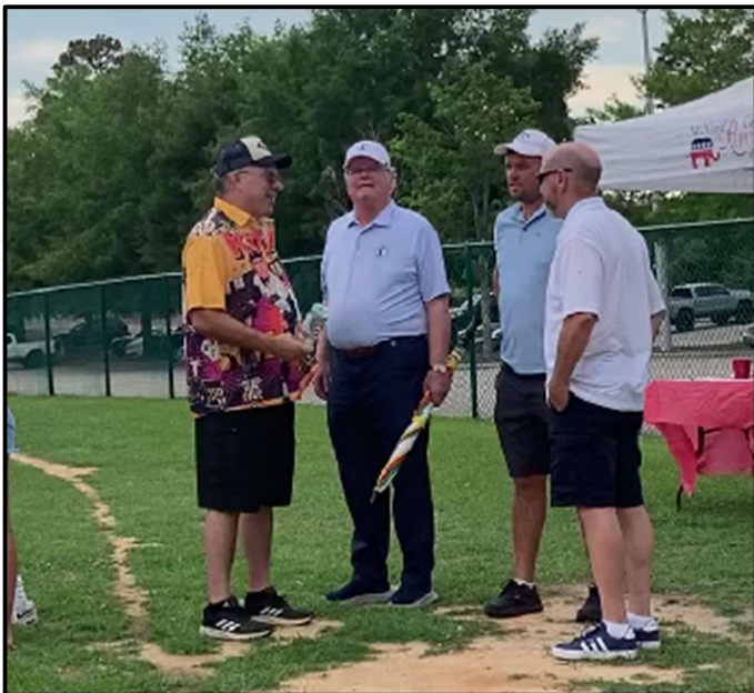
(MCRMC members chat before the game) enjoyable, even though the Bogeys fell short on hits and lost the game by just a couple of runs.