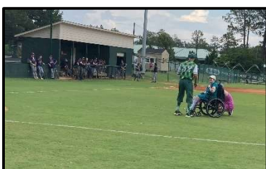
One of the highlights of the game was the opening pitch by a lady in a wheelchair. It took a lot of courage to get out there in front attendees and make